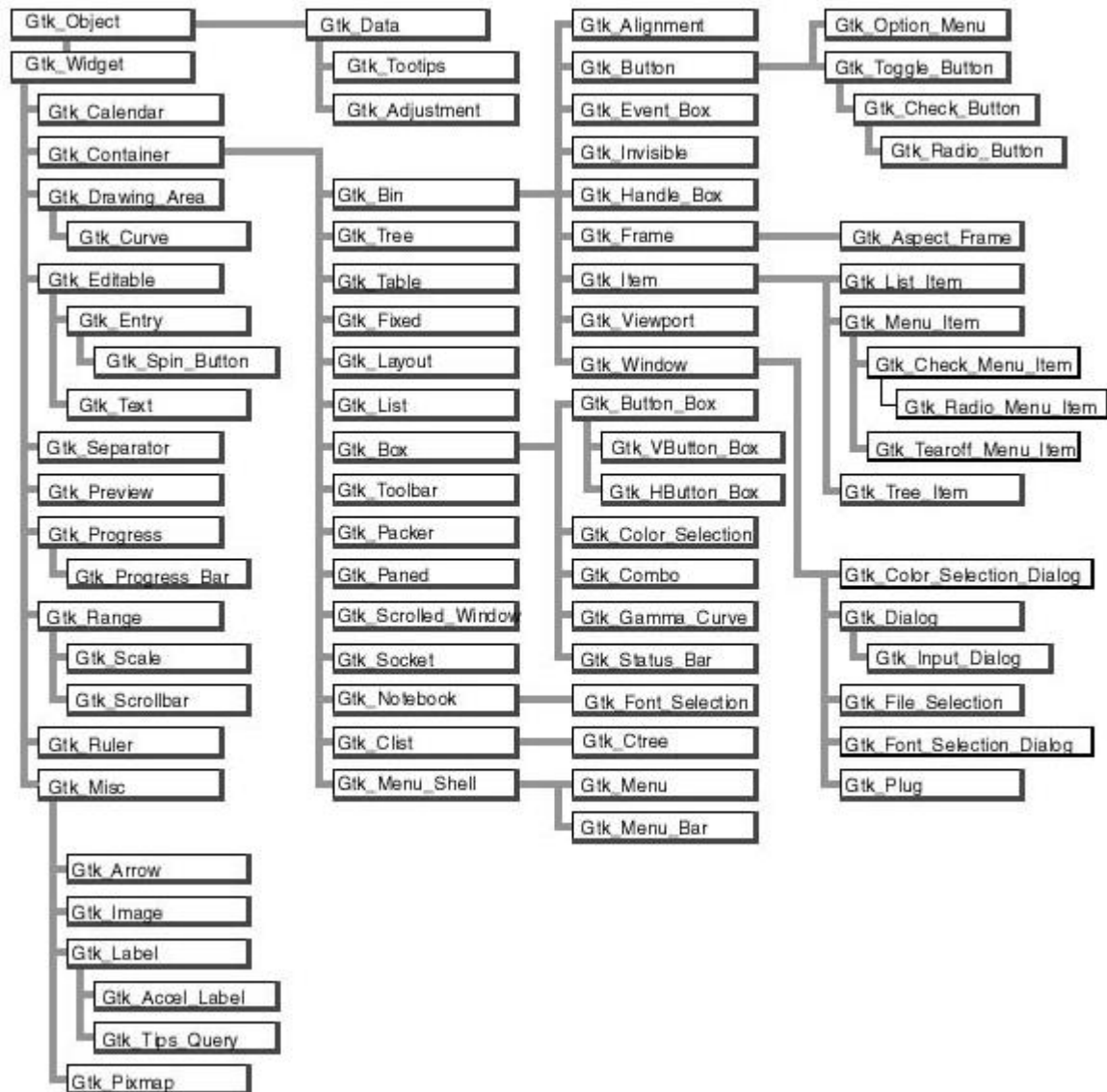
Fig. 1: Widgets Hierarchy